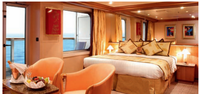
Grand Suite with ocean view balcony