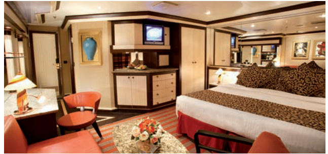
Samsara Suite with ocean view balcony