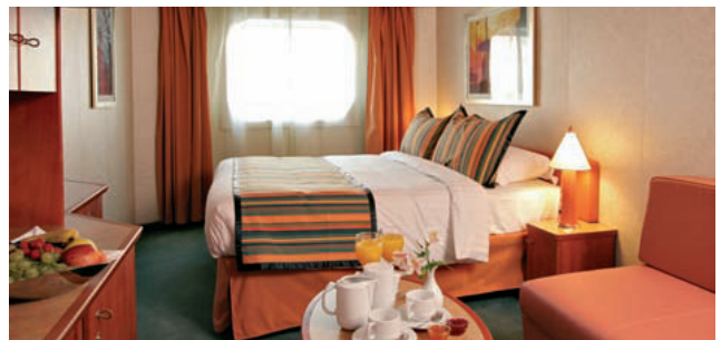
Outside cabin with ocean view balcony